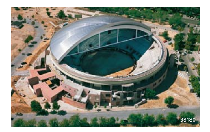
Protection against sun and rain: The roof sections can be gently turned into position, as needed.