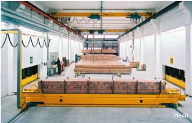
The load – positioned with millimetre accuracy – can be fed through the openings in the walls.