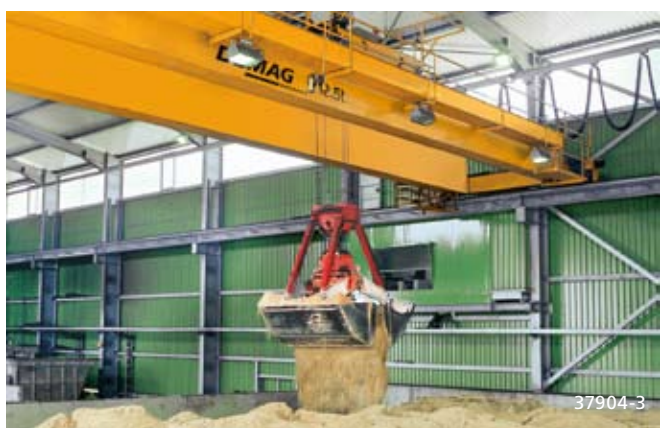
Four-rope grabs can be controlled to perfection with the Dedrive Pro.