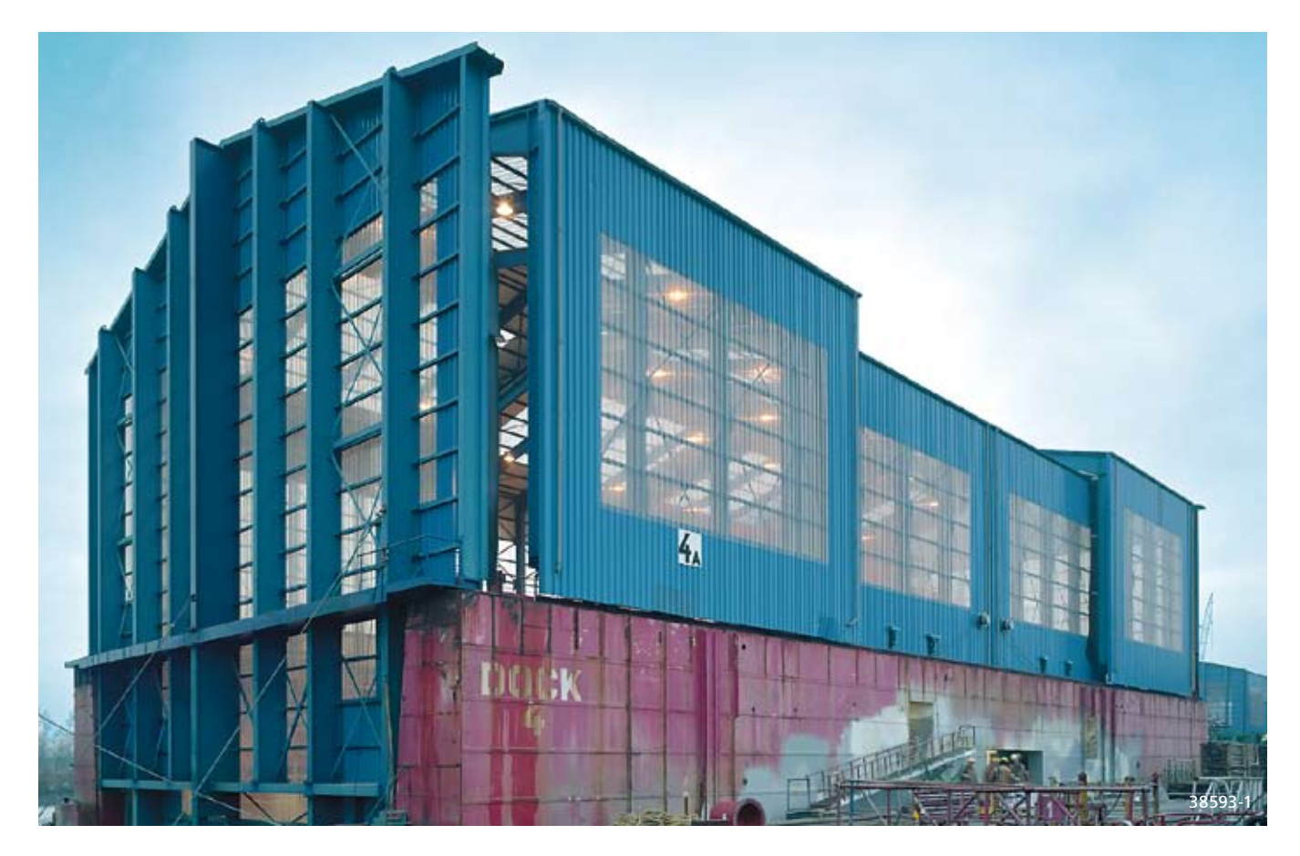
The roof sections of the dock can be opened smoothly.

A single component is often driven by many motors in order to achieve optimum performance and maximum functional reliability. Just one Dedrive Pro can be used for fully matching, simultaneous control of all the units in a multi-motor drive arrangement. In these applications, Dedrive Pro satisfies the technical as well as the financial requirements.