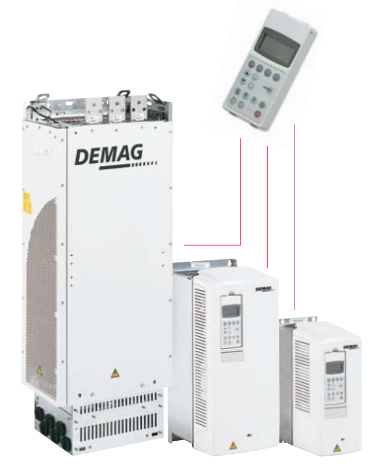
The operating terminal can be used for full control of every Dedrive Pro unit.

The cause of malfunctions can be identified and eliminated quickly by means of remote diagnosis from the control centre.