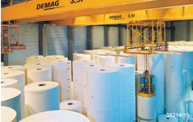
Smooth lifting and gentle deposit operations are also decisive for paper rolls.